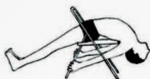
Dvi Pada Viparita Dandasana 5 min.