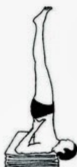
Salamba Sarvangasana 10 min.