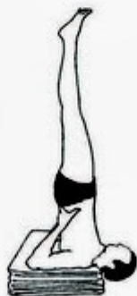
Salamba Sarvangasana 10 min.