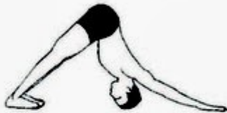
Adho Mukha Svanasana 5 min.