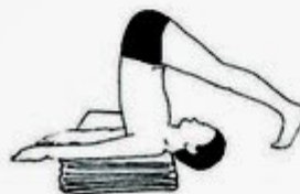
Halasana 5 min.