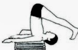
Halasana 5 min.