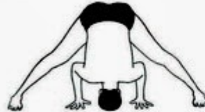
Prasarita Padottanasana head down 3 min.