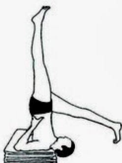
Salamba Sarvangasana Cycle