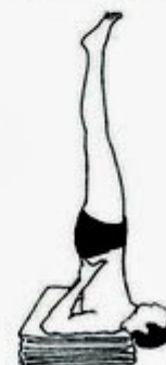
Salamba Sarvangasana Cycle 5 min.