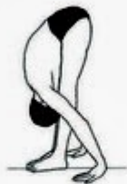
Uttanasana 5 min.