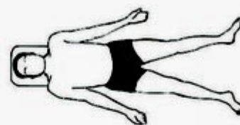
Savasana with Viloma or Ujjayi Pranayama 10 Min.